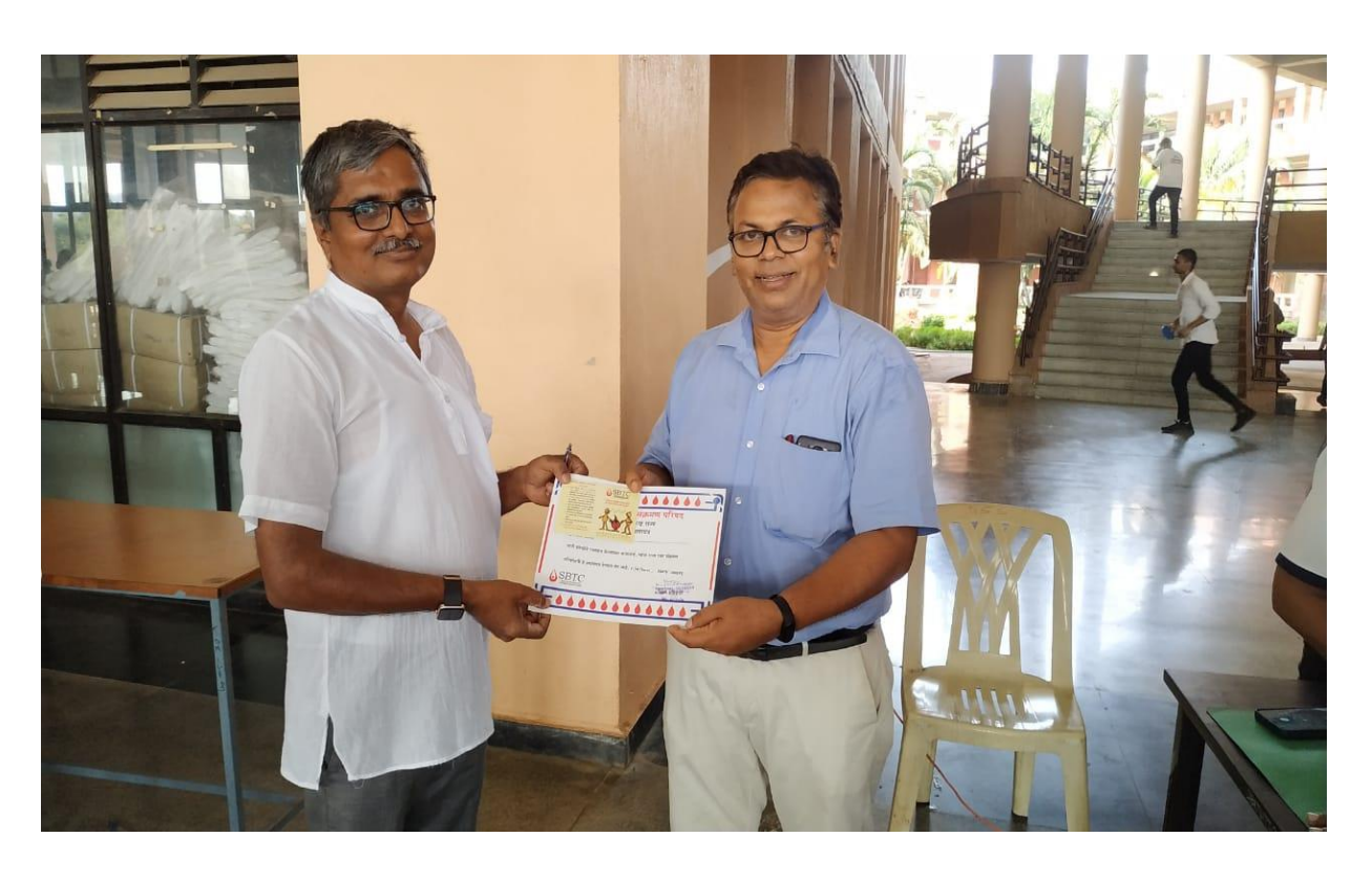
Shivswaraj Din celebration, Essay and Poster competition on 6th June 2022