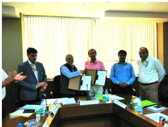
Signing of MOU between AICTE and Internshala on 27-04-2017 at AICTE Headquarters, New Delhi